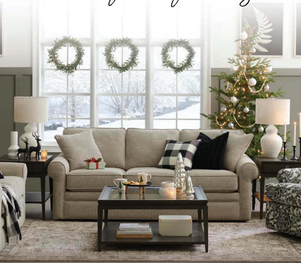
COLLINS Stationary Sofa