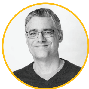
5th Floor, Room 520