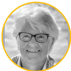
5th Floor, Room 517